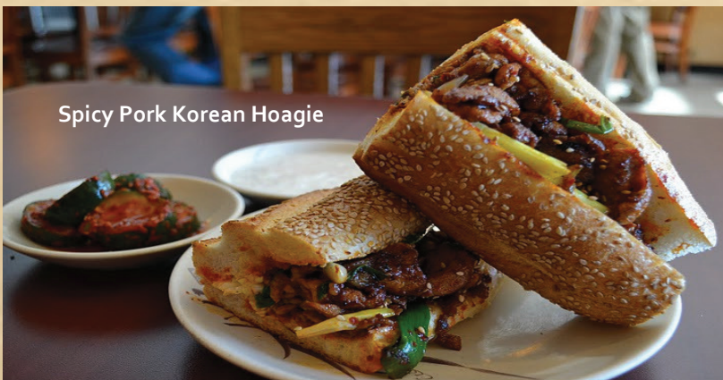
Spicy Pork Korean Hoagie

“ Top 10 new sandwich in America” Huffington Post