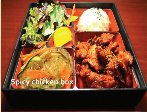
Spicy chicken box

7 DAYS A WEEK SUNDAY—SATURDAY 11AM-3PM Lunch combo boxes come with a BBQ meat choice, japchae noodles, salad & choice of white or brown rice.