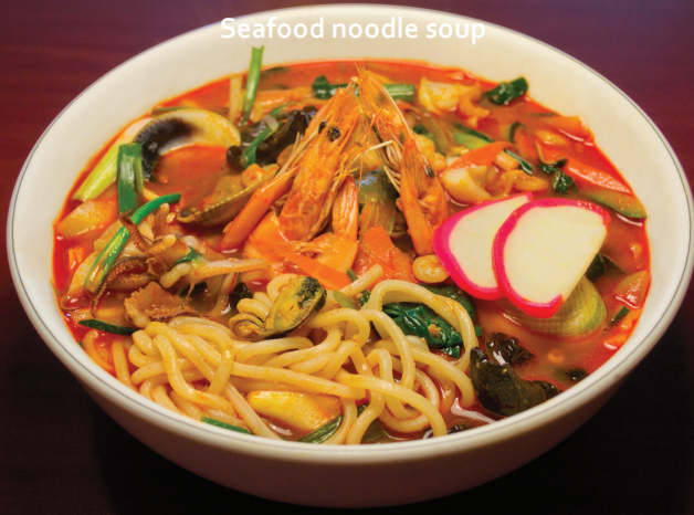
Seafood noodle soup