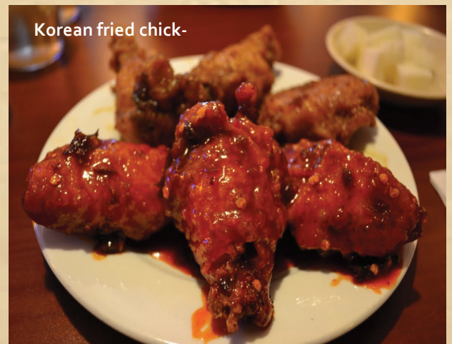
Korean fried chick-