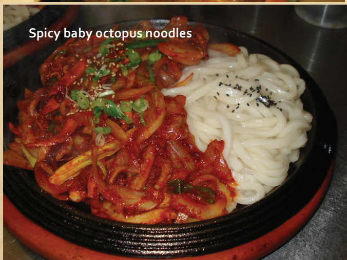
Spicy baby octopus noodles

Spicy octopus sautéed w/onion, carrot, zucchini & udon $20.99