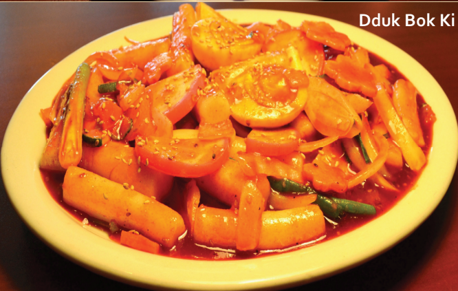
Dduk Bok Ki