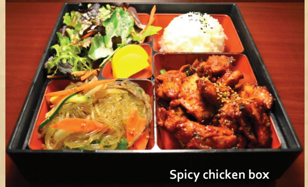
Spicy chicken box