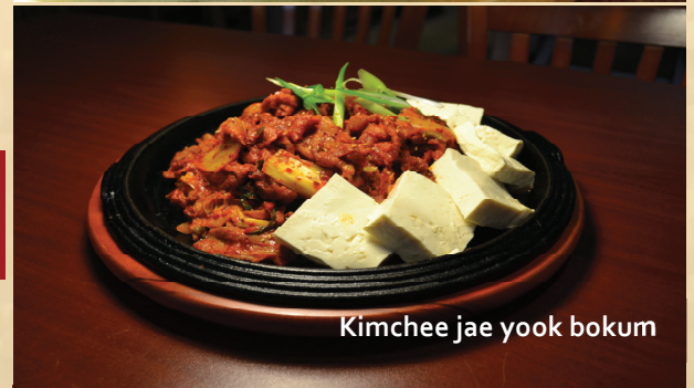
Kimchee jae yook bokum