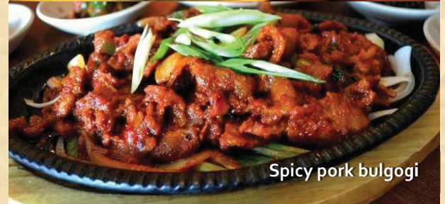
Spicy pork bulgogi