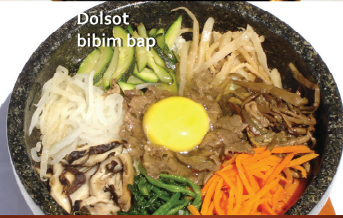
Dolsot bibim bap

조개 clam 蛤 굴 oyster 牡蛎, 곱창 beef tripe 牛肠,