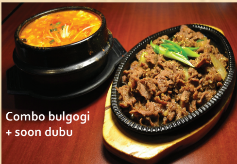
Combo bulgogi + soon dubu

combinations 1/2 entrée of BBQ + soon dubu or noodles