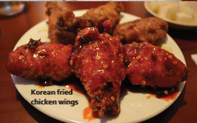
Korean fried chicken wings