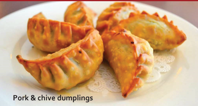
Pork & chive dumplings